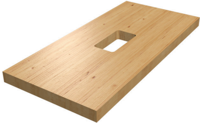
CUT HOLE IN WOOD